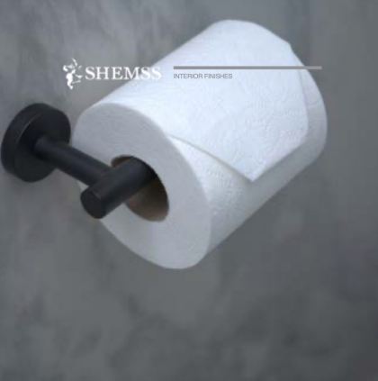
SHEMSS INTERIOR FINISHES