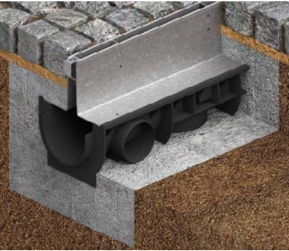
22 SHEMSS DESIGNER HOME MODEL PALOMA