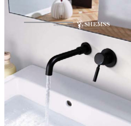
SHEMSS INTERIOR FINISHES

PRODUCT LINKS https://www.amazon.com/gp/product/B07R1KQF7H/ref=asc_inf