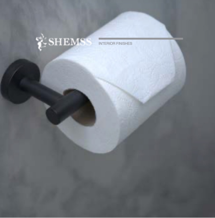
SHEMSS INTERIOR FINISHES