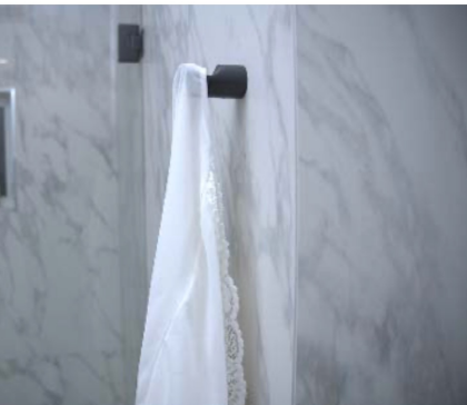
124 SHEMSS DESIGNER HOME MODEL PALOMA